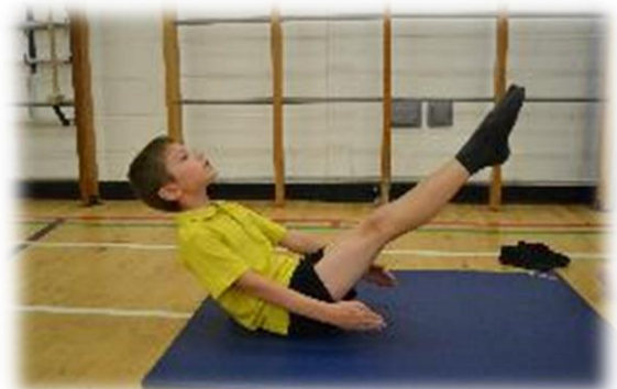
'I developed flexibility and body control to create a v balance.'

This includes reading, writing, listening and talking. It also includes modern languages. In St. Cuthbert's we teach Spanish from Nursery to Primary 7.