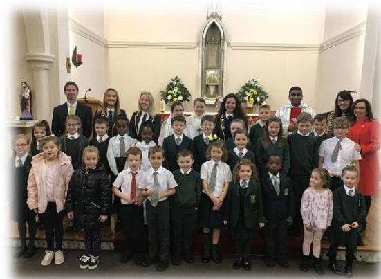
St Cuthbert's and St John Ogilvie joining together for Catholic Education Week 2019