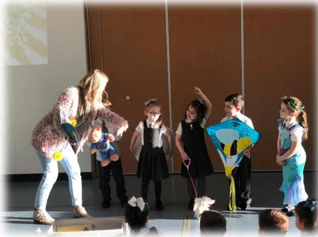
P1 Author visit