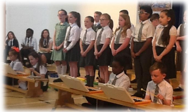
Pupils performing at the Music Showcase